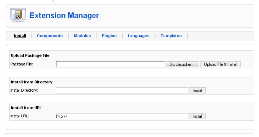
Joomla! 1.5 Extension Manager

3. In Mambo/Joomla! 1.0 click Installers # Components. In Joomla! 1.5 click Extensions # Install/ Uninstall in the Top Menu.